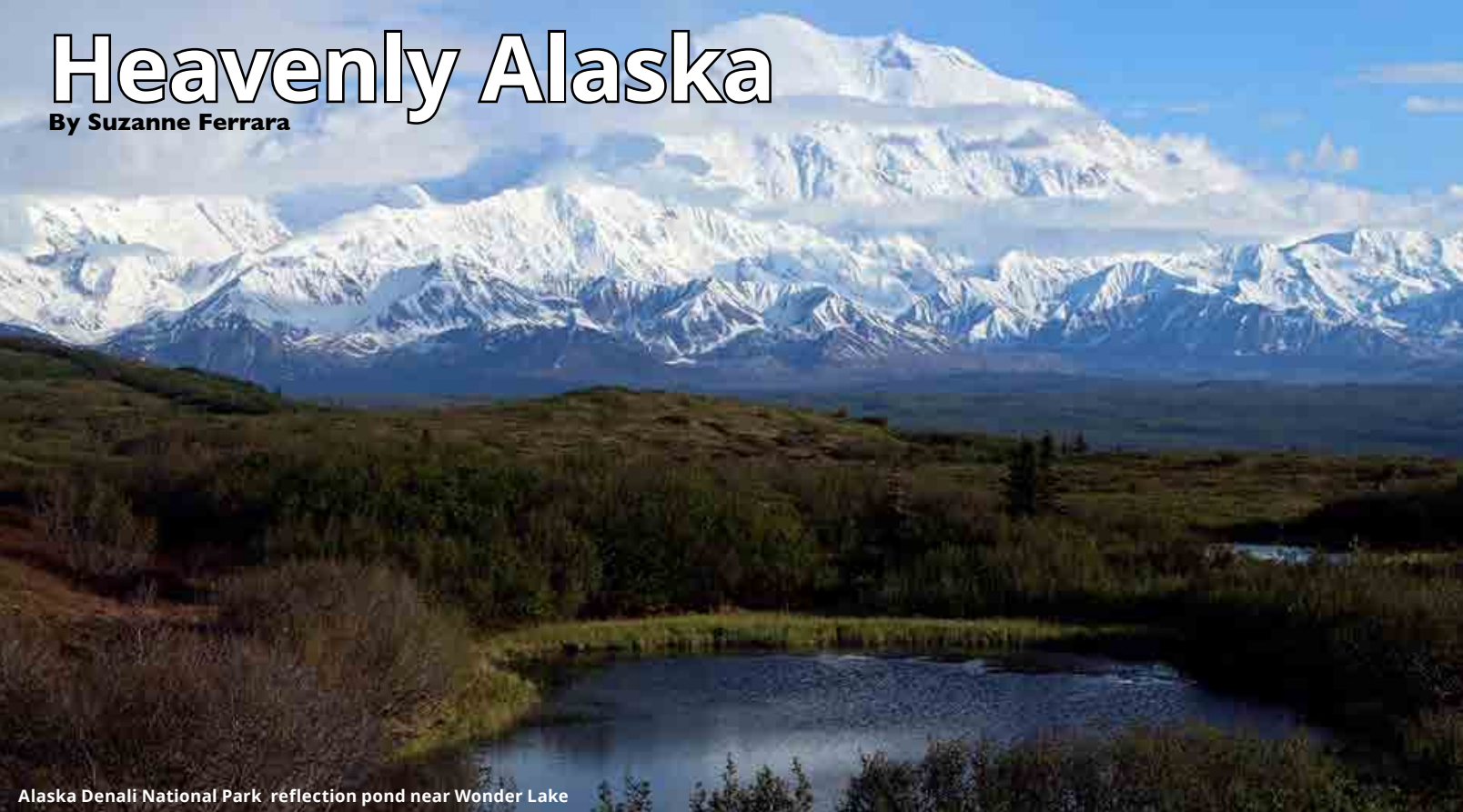
Alaska Denali National Park reflection pond near Wonder Lake

It's a magnificent sight that will all but bring you to your knees: Presenting the wild grandeur of Alaska's Denali National Park and Preserve.