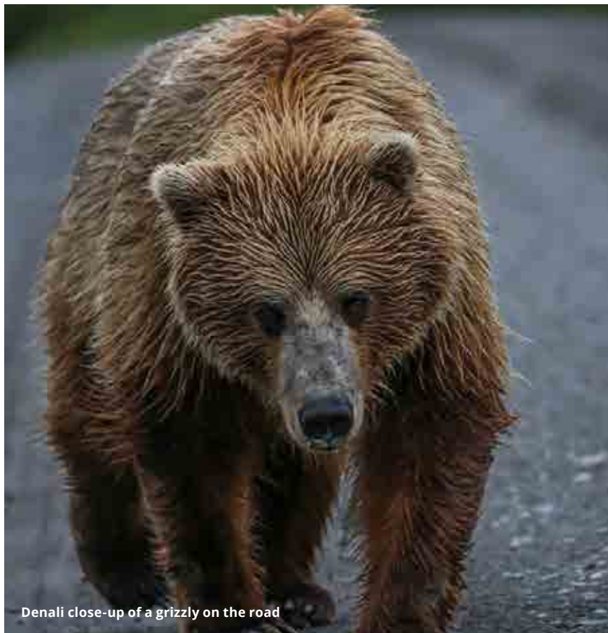
Denali close-up of a grizzly on the road

Among the most popular menu items are the Fish and Chips and the Beef Stew, although many come here just to try one of several refreshing locally-brewed beers. Another great choice is Moose-Aka's which serves mouthwatering eastern European dishes. Need more options? The Black Bear serves great espresso, pastries and Paninis inside a small, quaint log cabin. There are a handful of great accommodation options in Denali including several camping and RV sites with magnificent views. The McKinley Creekside Cabins and the Tonglen Lake Lodge are great places to make your home base. An exceptional choice is deep in the park is the Denali Backcountry Lodge which boasts a gorgeous spa and wellness center. You will long for nothing