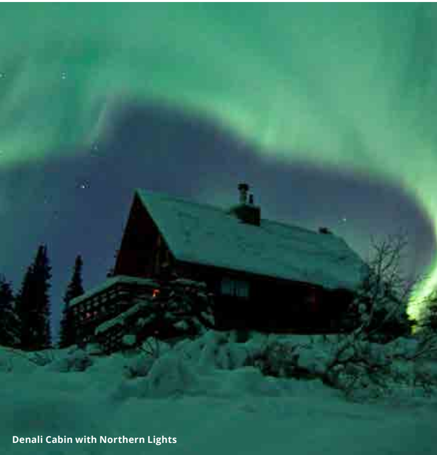
Denali Cabin with Northern Lights

Personal vehicles can drive up to mile marker-15, but from there visitors hop on one of three guided tour buses that take them all the way to the center of the park. The bus driver-guides are experienced and share enthralling natural history