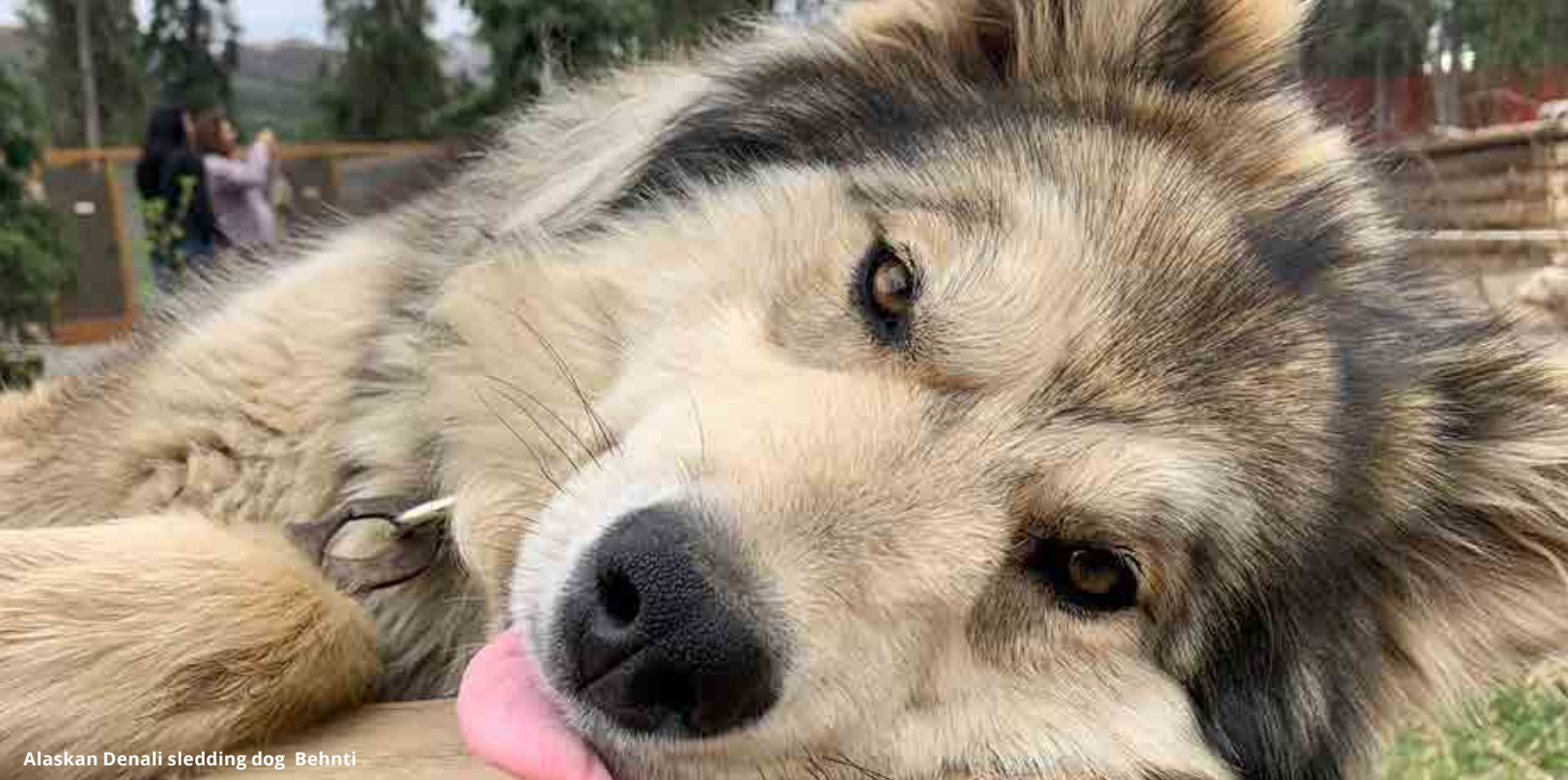
Alaskan Denali sledding dog Behnti

at this award-winning, adventure lodge which includes all-inclusive private cabins.