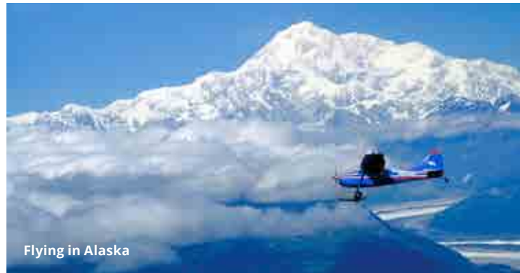
Flying in Alaska