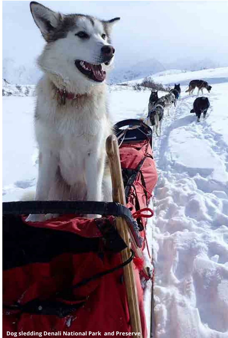
Dog sledding Denali National Park and Preserve