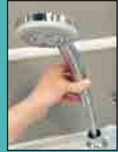
Hand Held Shower