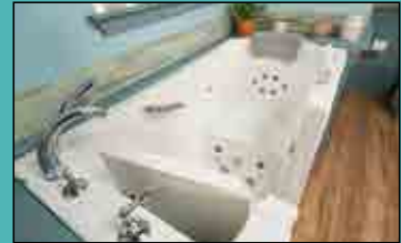
44 Hydrotherapy Jets

Only American Standard has OVER 140 years of experience and offers the Liberation Walk-In Bathtub.