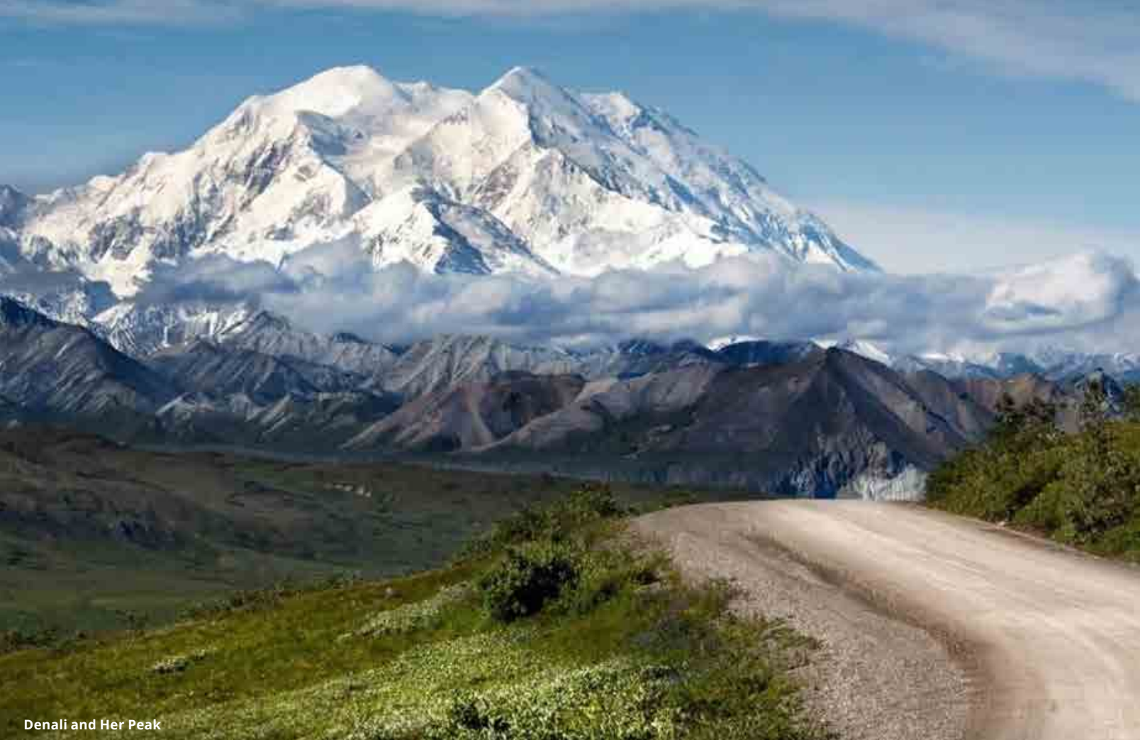
Denali and Her Peak

Denali Park Road. This mostly graveled path traverses through the stunning boreal forests and sub-arctic tundra and roves through the rolling mountainsides and sheer cliffs. There are also free bus rides, but they do not permitted past the public road at mile marker-15. (Tip: Great Alaska Adventures, a private outfit, has a three-day itinerary which includes a ride back to Anchorage on the historic Alaska Railroad).