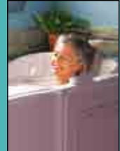
Comfort & Safety