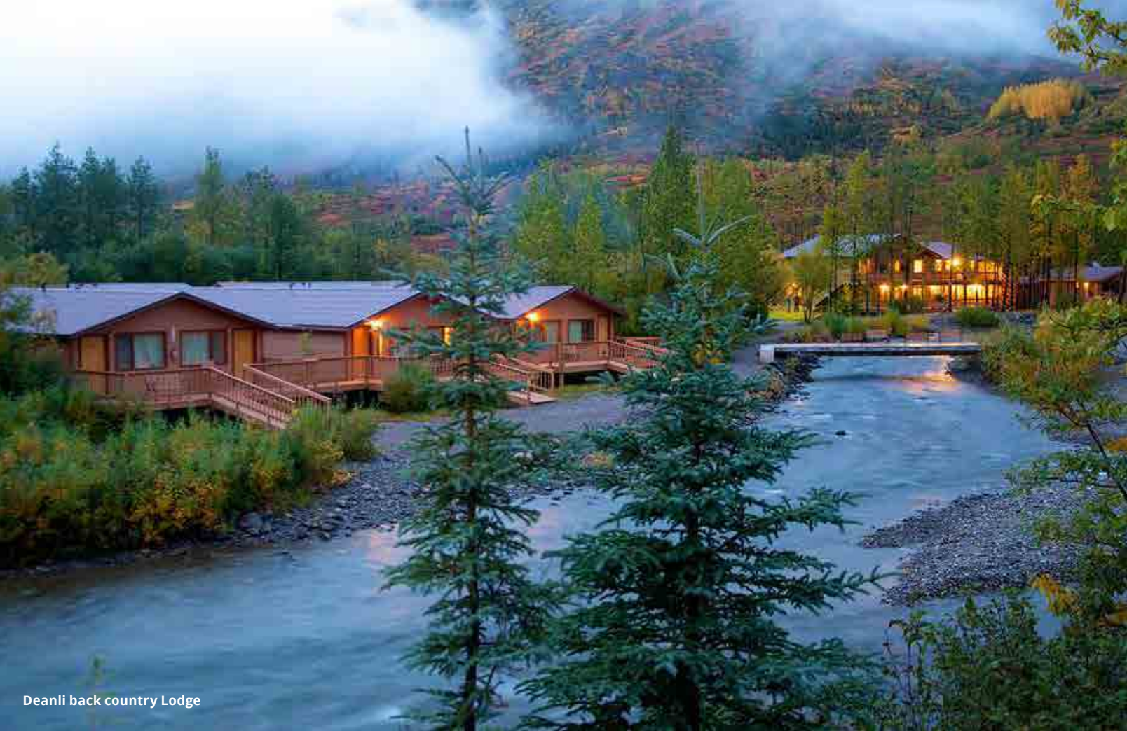
Denali back country Lodge

Among the most popular menu items are the Fish and Chips and the Beef Stew, although many come here just to try one of several refreshing locally-brewed beers. Another great choice is Moose-Aka's which serves mouthwatering eastern European dishes. Need more options? The Black Bear serves great espresso, pastries and Paninis inside a small, quaint log cabin. There are a handful of great accommodation options in Denali including several camping and RV sites with magnificent views. The McKinley Creekside Cabins and the Tonglen Lake Lodge are great places to make your home base. An exceptional choice is deep in the park is the Denali Backcountry Lodge which boasts a gorgeous spa and wellness center. You will long for nothing