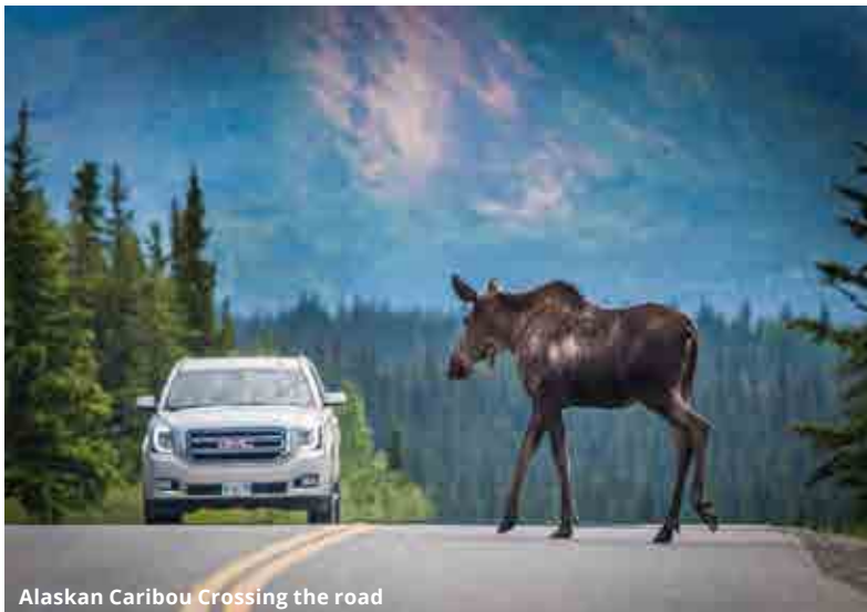
Alaskan Caribou Crossing the road

You need at least three days and two nights to experience this 'heaven on earth'; however, choosing more than three days is wise due to the unpredictable weather. This entrancing wilderness is so immense and awe-striking that several visits to Denali are recommended in one's lifetime. Once you've been spell bounded by this marvel of the world, you will long to return again and again.