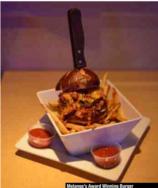
Melange's Award Winning Burger

Melange hosts a Happy Hour daily from 5pm to 8pm with daily drink and food specials. On Fridays there's a complimentary Happy Hour Buffet from 5 pm to 8 pm. Free Live Karaoke on Thursdays 10 pm to 2am. The kitchen is always open until 2 am!