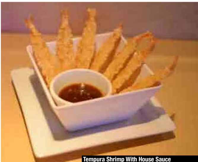
Tempura Shrimp With House Sauce