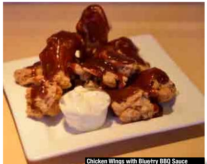
Chicken Wings with Blueberry BBQ Sauce