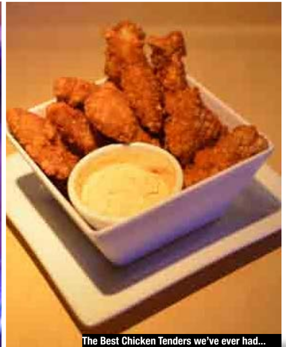
The Best Chicken Tenders we've ever had...