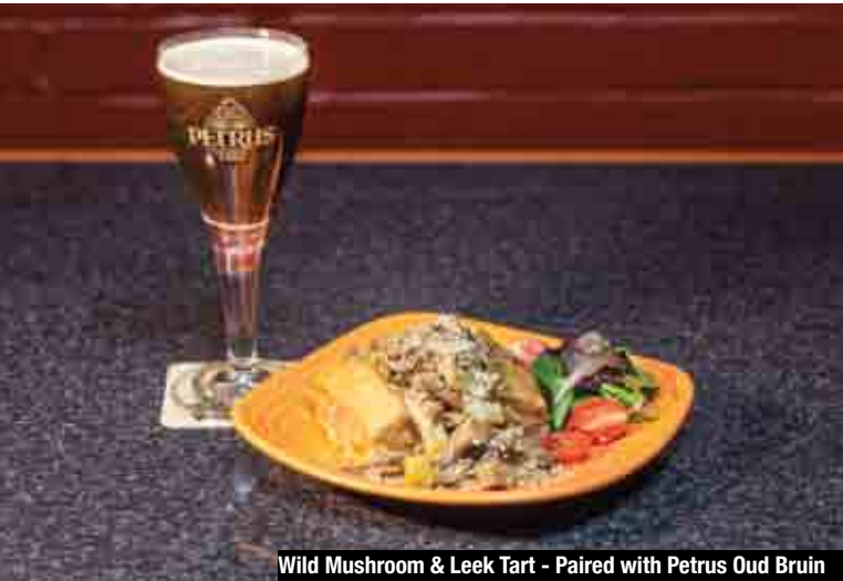
Wild Mushroom & Leek Tart - Paired with Petrus Oud Bruin