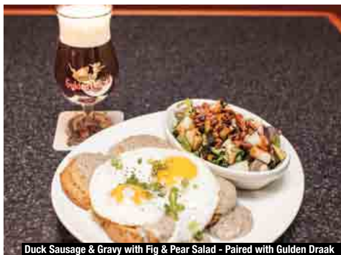
Duck Sausage & Gravy with Fig & Pear Salad - Paired with Gulden Draak

One last note the Sharp Edge boasts an award winning Happy Hour and for the past 18 years the best beer selection in the city. Check them out and as always- tell then your friends at Nightwire sent you!