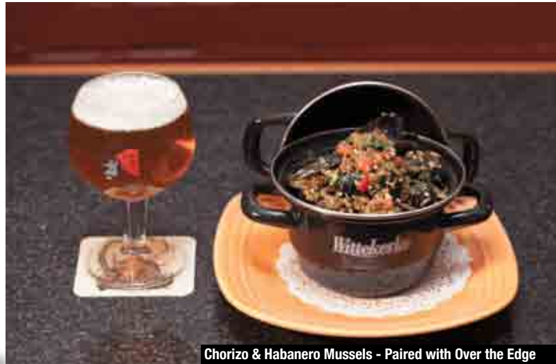
Chorizo & Habanero Mussels - Paired with Over the Edge

R ecently we stopped by our friends at the Sharp Edge to get some information on their Christmas Belgian Beer selection (which is awesome!) and before we knew it, we were invited to visit the Sewickley Bistro for some fantastic food and beer pairings. The Sharp Edge really knows craft beer and their Christmas selections are far too numerous to begin to mention. They have over 70++ Christmas beers! The Sharp Edge is your Belgian Beer connection.