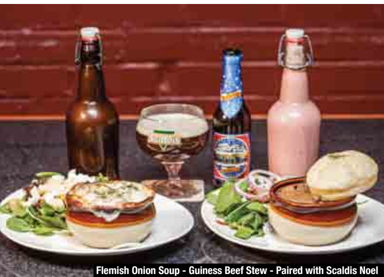
Flemish Onion Soup - Guinness Beef Stew - Paired with Scaldis Noel

All Sharp Edge Bistro's serve an amazing selection of soups & salads. On this night, we tried the Flemish Onion ($7) a delicious take on classic Onion Soup with an addition of Augustin Abbey Ale to add that something special flavor. We also tried from the Chef's Feature menu the Guinness Beef Stew - slow cooked with Guinness Stout and topped with a flakey puff pastry crust. Salads we sampled included a Field Green Salad ($6 side, $9 full) with fresh baby greens and crisp romaine topped with crumbled chevre, toasted pecans, dried cranberries and sliced gala apples; and the Spinach Salad ($6 side, $9 full) spinach topped with roasted walnuts, crumbled bleu cheese, crispy bacon, grape tomatoes and red onion. The salads were very fresh and flavorful with excellent mixes in each. All dressings are house made but be sure to sample the raspberry, it's my personal favorite! I couldn't say which salad I liked better but I'm glad to report that the salads can also include grilled chicken, marinated flatiron steak, grilled salmon, or a grilled marinated Portobello cap. There's something on their menu to suit every taste or mood and a beer to be paired with every selection. Again, don't be