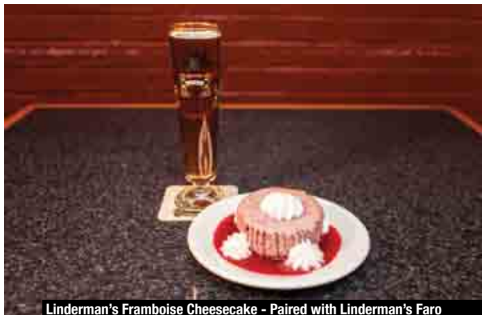
Linderman's Framboise Cheesecake - Paired with Linderman's Faro

were presented with a Sharp Edge favorite -Lindeman's Framboise Cheesecake ($6). I personally think it's a "must have" and my favorite pairing with the Lindeman's Faro. This beer is made from malt, wheat, hops, water and yeast. Candy sugar is added before the bottling takes place. It produces a clear, light red colored faro lambic with a small creamy head. If you're familiar with the other Lindeman's lambics such as Pesce, Pomme or the Framboise, the Faro is highly recommended. Its sweet clear flavor certainly left an impression on my palate.