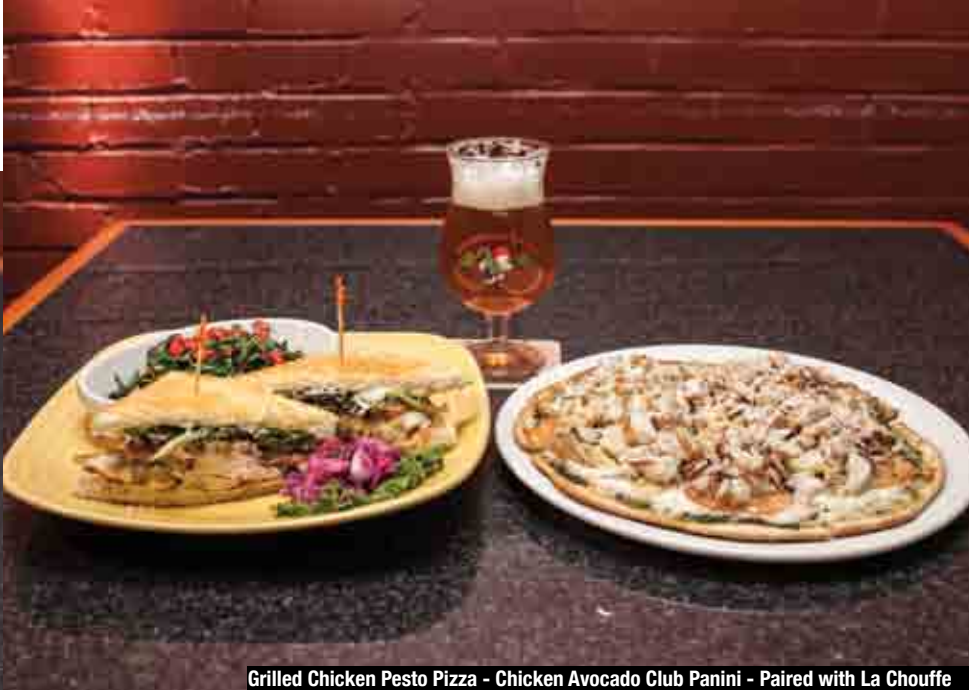
Grilled Chicken Pesto Pizza - Chicken Avocado Club Panini - Paired with La Chouffe

afraid to try something different or ask for help in choosing the perfect pairing.