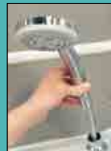
Hand Held Shower