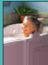
Comfort & Safety