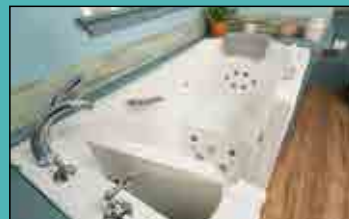
44 Hydrotherapy Jets

Only American Standard has OVER 140 years of experience and offers the Liberation Walk-In Bathtub.