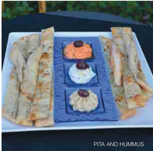
PITA AND HUMMUS