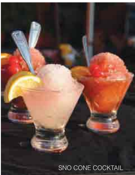
SNO CONE COCKTAIL