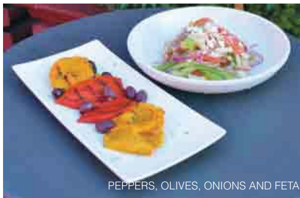
PEPPERS, OLIVES, ONIONS AND FETA